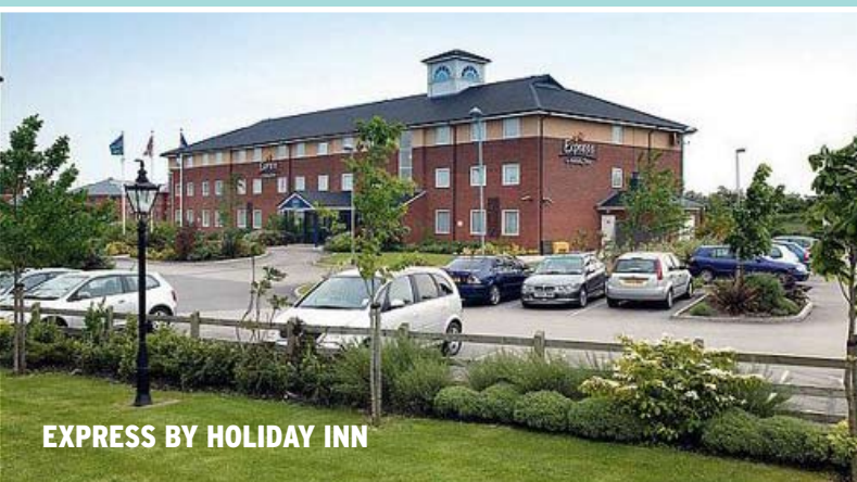
EXPRESS BY HOLIDAY INN

Typical floorplan - not to scale and for identification purposes only.